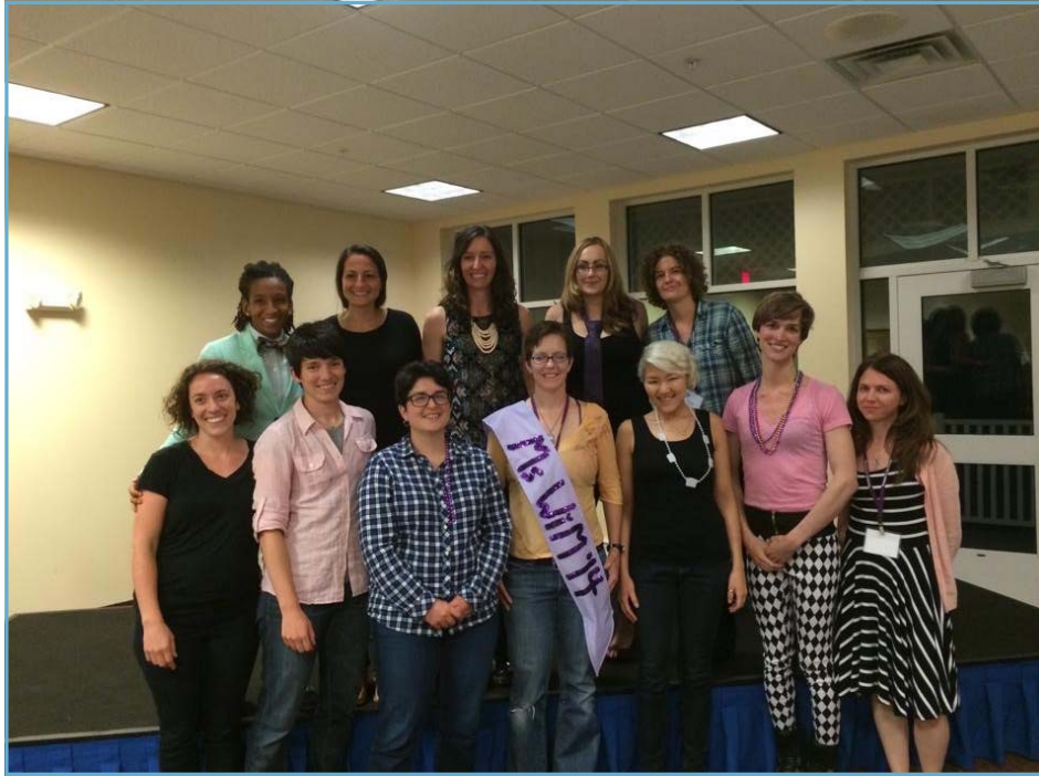
Medical Students at WIM 2014