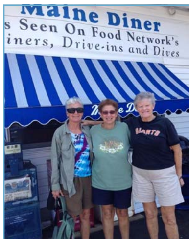
Dining Out in Maine