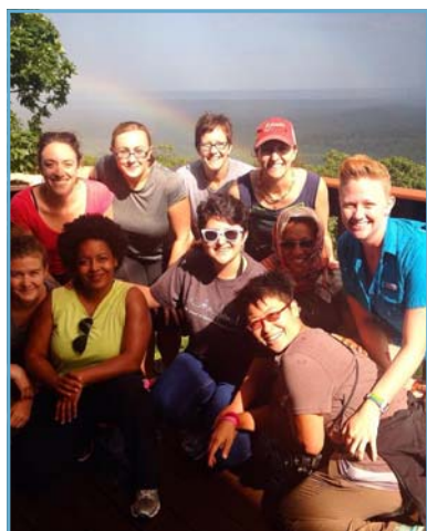
Enjoying a hike