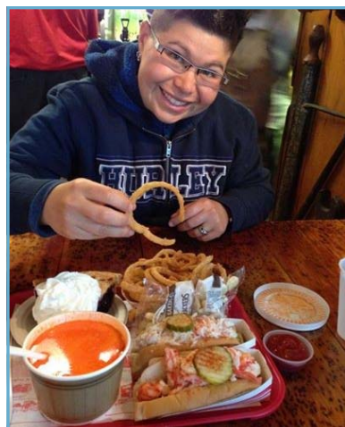
Enjoying everything lobster